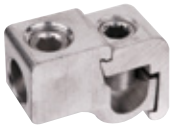
Type GT – Aluminum dual-rated mechanical parallel tap connectors

* Slotted screw, tap side. To include insulating cover, add suffix WC.