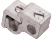
Type GP – Aluminum dual-rated mechanical parallel tap connectors

Type GP, Type GT, Type TC and Tightening torque values for aluminum dual-rated socket screw connectors